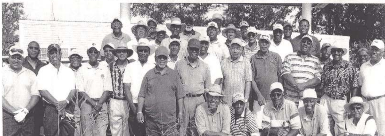
Golf Committee Members and Golf Participants