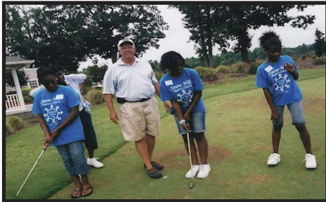
Fun & Fitness Day Participants practice their golf swing.

We hope you've had time to recuperate after Fun & Fitness Day as well as the SHS Reunion. It was great socializing once again with long-time friends and school mates. We enjoyed all the activities and several members have ranked our 38th Annual Reunion among the best. The Reunion Committee and the Clinton Chapter did a terrific job!