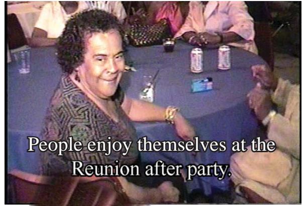
People enjoy themselves at the Reunion after party.