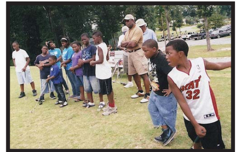
More youngsters try their hand at golf.