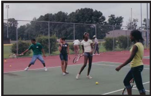
Fun & Fitness Day participants work on tennis techniques.