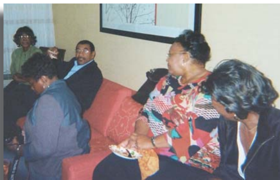
Members enjoy fellowship after the Fall Executive Board Meeting.