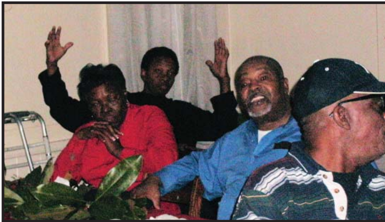
Guests socialize at the Clinton Chapter Christmas Party.

Clinton Chapter has graciously accepted the honor to host the 2010 Reunion. The Reunion information will be sent out soon. You can mark your calendars for the Reunion dates, August 13-15, 2010.